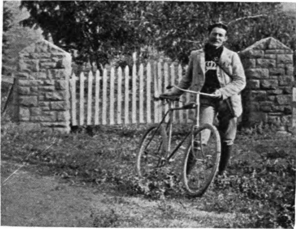
Mausard-Collier Eng. Co